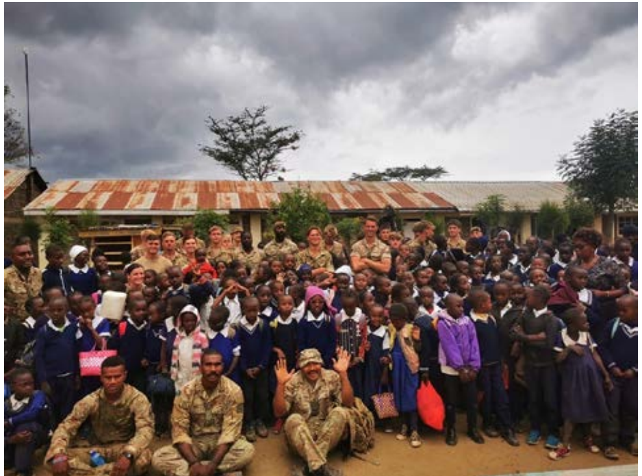
■ 1YORKS in Kenya

As we enter the Christmas season, the past twelve months have given the 1st Battalion much to reflect upon with pride. Having started the year as an Armoured Infantry Battalion, 1YORKS is now mid-way through conversion to Light Mechanised Infantry as we see out 2022. The garages at Catterick are full of new Foxhound and Jackal vehicles and our training has achieved a huge amount since we joined the Desert Rats in April. Along the way, we have deployed soldiers to 12 different countries and supported the Army's operational outputs in Estonia, Nigeria, the Falkland Islands and Mozambique. The Battlegroup HQ has trained on Divisional-level exercises in Germany twice this year, and Alma Company and the Recce Platoon have had a hugely successful exercise in Kenya. We have also enjoyed significant sporting success winning the Army Rugby Premiership and reaching the semi-finals of the Army's Cricket and Football championships. The prospects for 2023 are similarly exciting and from early January will be dominated by preparing for operations in Iraq and Kosovo;