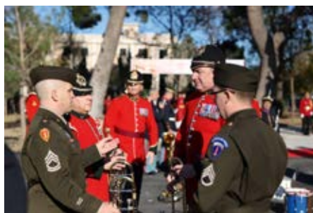
■ The Band in Albania

The regular drumbeat of Army Reserve activity has continued at pace. Traditional training weekends have continued to sharpen Infantry skills whilst the usual core winter Battalion events again proved to be a great success. 4YORKS were represented across the county during the Remembrance period including at several sporting events. Most notably, performing the Act of Remembrance during several Rugby League World Cup events. The Battalion Christmas weekend was well attended with Corunna Coy being crowned as Champion Coy following the annual Champion Coy competition. And