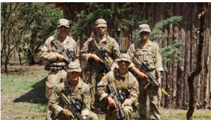
■ Alma Company in Kenya