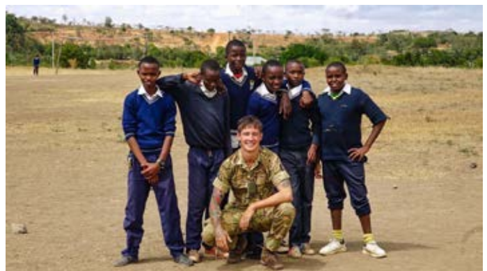
■ Making new friends in Africa