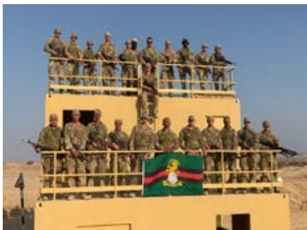
■ Kohima Company in Oman

This was a first for the Army Reserve and whilst there were obvious challenges, the deployment has been hailed a success. Kohima Coy first came together in the wilds of Otterburn to mobilise and conduct PDT before deploying to the vast deserts of Oman to train alongside and provide a stern challenge to the Battlegroup.