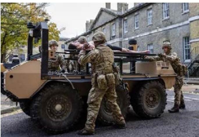
■ Army Warfighting Experiment – Portsmouth