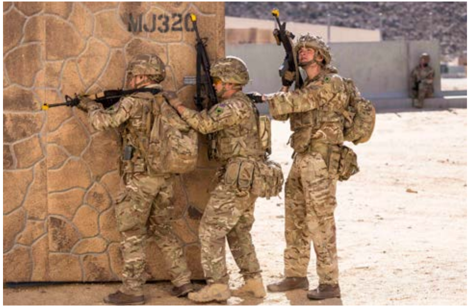
■ 2 YORKS Convergence

Not to be content with this new level of busy, the Battalion was able to squeeze in an intercontinental move from Cyprus to Chester that went without hitch and is credit to the planning and preparation of the Quartermaster and Battalion Second in Command's teams. After the dust had settled in The Dale, Chester, we launched the ambitious and exciting Next Generation Combat Team on the 12 Oct 22. This new role contributing to making the Army more relevant, more lethal and more agile brings the