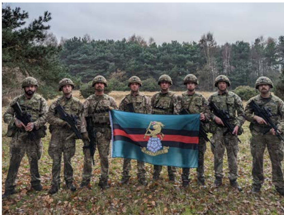
■ Corunna Champion Company