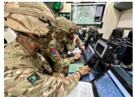
■ Op CERBERUS Germany