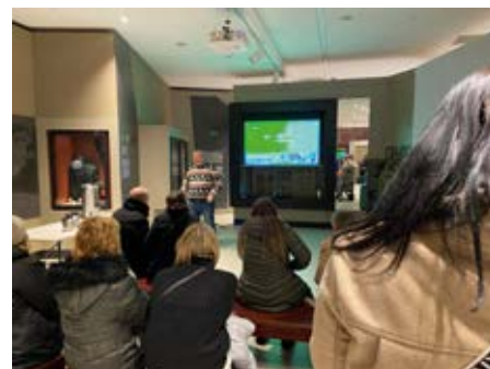
■ Millennium Branch in YAM