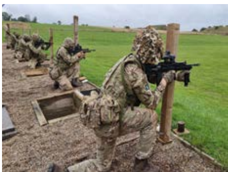
■ Kohima Company at Otterburn

As 2022 draws to a close I must draw upon the similarities with my previous winter update as 4 YORKS have once again successfully recovered a significant portion of the Battalion home from a large overseas deployment. This time, 28 4YORKS Reservists have spent the latter part of the year deployed in Oman alongside their regular counterparts as part of the 2 SCOTS Battlegroup on Ex DESERT KHANJAR 22. Their task, to provide a credible enemy force to 2 SCOTS under the guise of Task Force Hannibal.