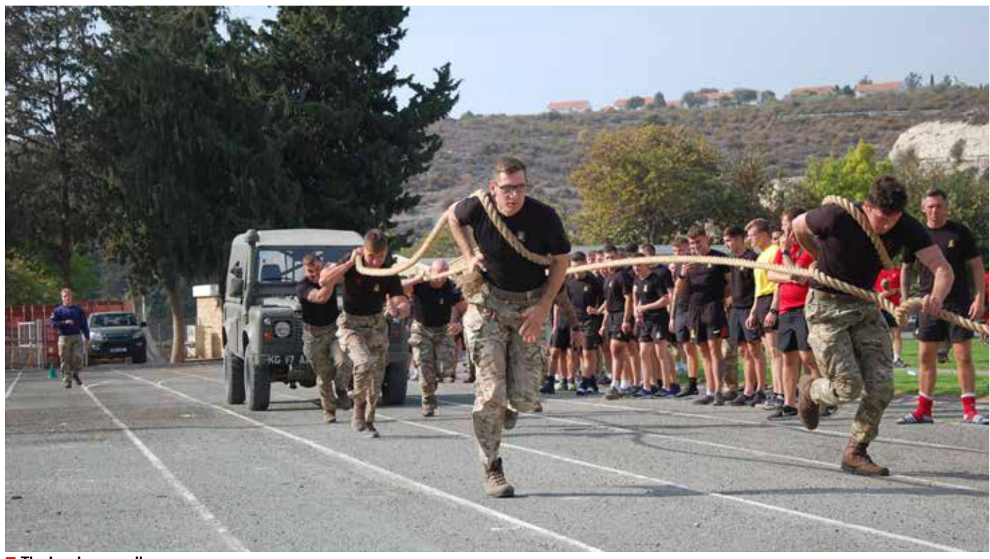
■ The Landrover pull