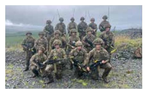
Ex Yorkshire Strike in Galloway