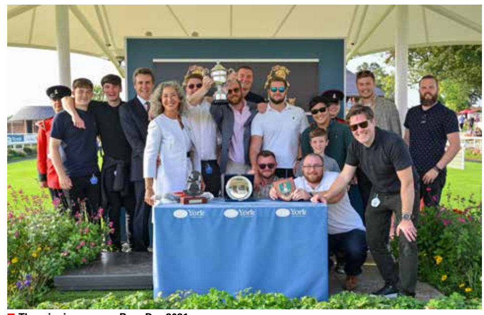
■ The winning owners Race Day 2021

07943 612521 vorksassociation@btconnect.com