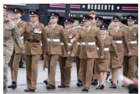
Alma Company Remembrance Hull

September saw the Battalion deploy on our second ADE of 2021 to Kirkcudbright and Galloway Forest. This two-week package contained a challenging LFTT element before switching onto a dry phase in Galloway Forest. The physical and mental demands placed upon our Soldiers and Officers from the terrain and weather were telling; however, both the combination of experienced PSIs and the grit from the troops ensured a successful deployment. The fortnight culminated with a rewarding AT package organised by OC Burma Coy. Soldiers and Officers took part in activities such as mountain biking, rock climbing and coasteering with a stunning backdrop of the Solway Firth.