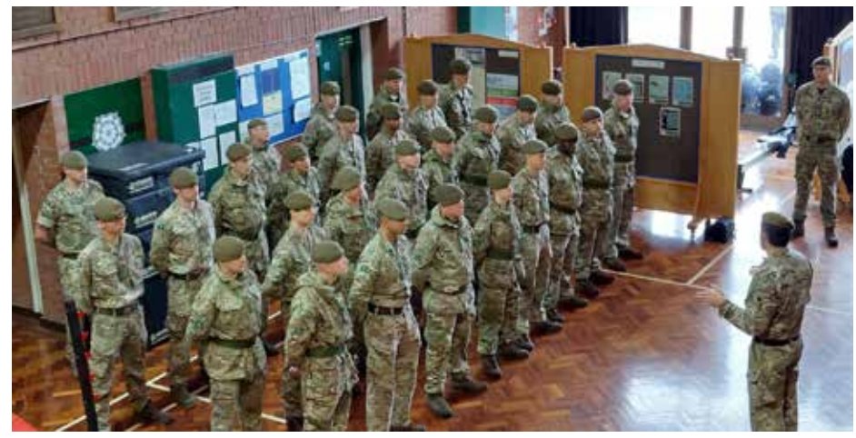
CO 4YORKS and Kohima Platoon

As ever, the Remembrance period brings sharp focus for the Army Reserve and 4 YORKS, under the direction of the RSM, was once again a presence across the county. We laid wreaths in over 20 towns and cities and participated in parades in Hull. Middlesbrough, Huddersfield and York as well as representing the Regiment at football matches at Sheffield United and Leeds United. The Battalion's crowning achievement was the mobilisation and deployment of Kohima Platoon to conduct Force Protection duties at the British Army Training Unit in Kenya over Christmas and New Year. The Platoon has now completed its pre-deployment training and at the time of writing has arrived in theatre conducting RSOI prior to assuming its force protection duties. They will take over from The Royal Gurkha Rifles and will remain in place until the middle of February. This is only the second time the Army Reserve has assumed the BATUK Force Protection role. The challenges and nuances of deploying a formed Army Reserve force will serve the Battalion well as the Regular Army decreases in size and deployments such as this become the norm for the Reserve.