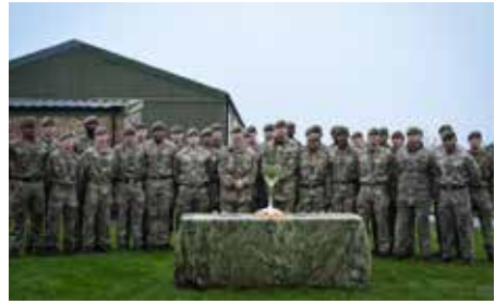
■ Winners 12 Bde Op Shooting Competition

Finally, looking to the future, the confirmation next year we will transition to a new Light Mechanised Infantry role after nearly 20 years as Armoured Infantry is a fantastic opportunity for the Battalion to seize, and will result in a more stimulating, dynamic, relevant and deployable role over the next decade. The Battalion has also now got the certainty that it will remain in Catterick Garrison for the remainder of this decade, before moving for a two-year rotation to Cyprus as the Regional Standby Battalion, likely in 2029.