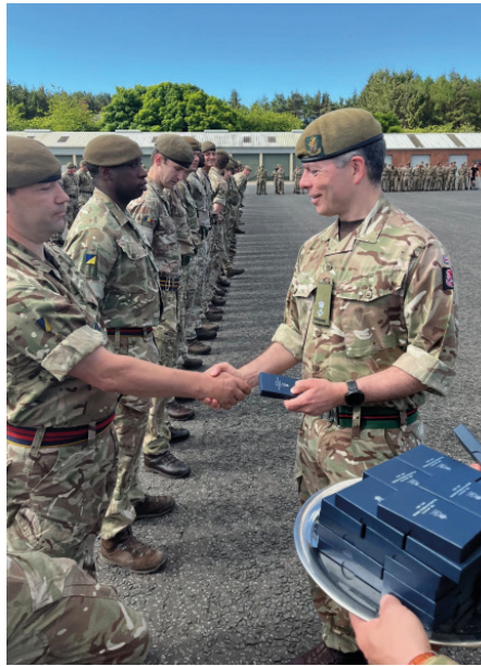
■ 1YORKS Awards Parade in June