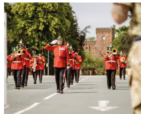
■ The Band at the 19 Bde Reformation Parade