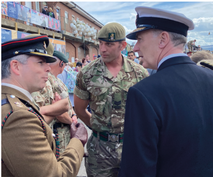
■ CO1YORKS with Chief of the Defence Staff at AFD

In this Platinum Jubilee year, we have already held two Regimental Cocktail Parties (at 1 YORKS and the Great Yorkshire Show) and a Regimental Dinner (at 4 YORKS), which has allowed us to host a good cross-section of the civic and military community. In June, we celebrated the public opening of the British Normandy Memorial, but perhaps the most spectacular success has undoubtedly been National Armed Forces Day 22 in Scarborough. Conservative estimates suggest that 100,000 people attended on Saturday 25th June and