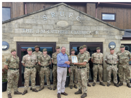
■ Providing AFD 2022 Real-Life Support at Scarborough Rugby Club.

Whilst field training remains at the core of what we do, we have yet again found ourselves immersed in multiple community engagement activities across the county. The Battalion was heavily involved in June's Armed Forces Day, providing the enabling element in Scarborough, as well as individuals at events across the weekend. Another huge effort was applied to the Military Village at of the Great Yorkshire Show. We were proud to host and cohere this prestigious event and I am again truly grateful for the enormous effort from across the Battalion.