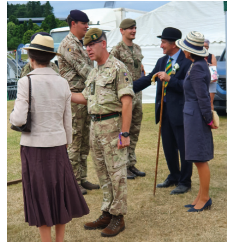
■ Welcoming HRH The Princess Royal to the GYS Military Village

they will have witnessed 1 YORKS march through the town with our Band playing and Colours flying; with the real-life support at Scarborough Rugby Club and Driffield, expertly coordinated by 4 YORKS. A Gala Dinner was held on the night before at the Scarborough Spa with 350 guests attending,